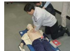
AED training session

Based on the fundamental policy that safety and health should have the highest priority, we have been taking steps to prevent accidents at work and promoting good health of our employees. Our manufacturing divisions are leading efforts to enhance safety, striving to prevent accidents by ensuring manufacturing facilities are fundamentally safe. Initiatives to manage employees’ health include measures to prevent illness such as installing AED equipment, requiring employees to have medical checkups of the brain, as well as measures to promote good mental health.