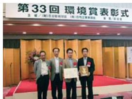
In 2006, the device was awarded the 33 rd Environment Prize jointly sponsored by the Hitachi Environment Foundation and Nikkan Kogyo Shimbun Ltd.