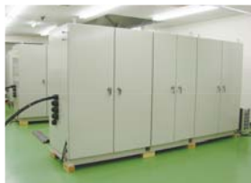
External appearance of the CP-2000P PCB monitor. The front hose takes in gas from the test facility for measurements.