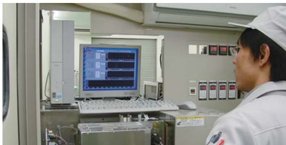
The CP-2000P PCB monitor is fine-tuned at our plant test facility prior to shipment. Technicians work on individual units to fine-tune the devices.

The CP-2000P produces highly precise measurements. The system uses atmospheric pressure chemical ionization (APCI) and ion-trap method. The system can be operated continuously for several months due to its' low-maintenance design, which we developed in order to provide trouble-free operations at disposal facilities. This technology supports the safe disposal of PCBs by real-time online measurements of PCB generation.