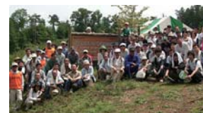
Tree planting (Yasato Forest)

Our group carries out various volunteer activities to contribute to environmental preservation. In 2008, volunteers from offices in eastern Japan participated in the Hitachi High-Tech Yasato Forest project and in a Jonanjima beach cleanup on Tokyo Bay. At Hitachi High-Tech Fielding, volunteers from eastern, central and western offices participated in the HISCO Forest project. Kasado Division volunteers participated in the Hanaguri/Shirahama Beautiful Beach Project and other local cleanup projects.