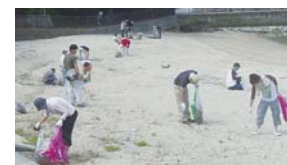
Beach beautification (Kasado Div.)