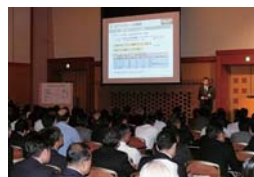
An information meeting for the second half of fiscal 2010 held for business partners in the Naka area

The Hitachi High-Technologies Group is working to build favorable partnerships with its procurement sources and suppliers, and to maintain and enhance a relationship of mutual trust and understanding with them. Based on a common procurement policy for the Hitachi Group, we carefully select suppliers and procurement sources regardless of whether they are domestic or overseas companies. We go through an appropriate procedure to adequately assess quality, delivery time, price, technology development capabilities, environmental certification and other features as well as whether the